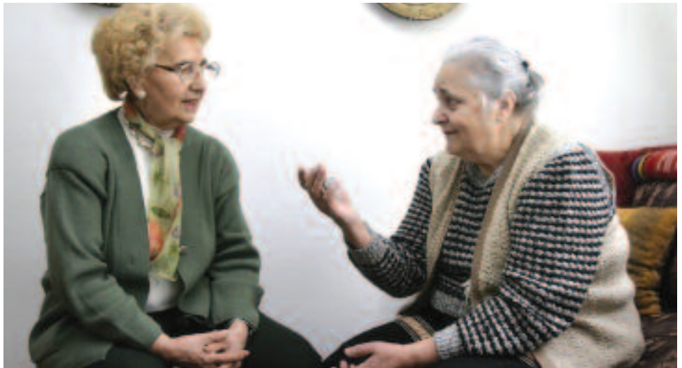
Older people in residential care should benefit from the hygiene methods outlined in SFBB for Care Homes

To ensure these safe methods provide a complete food safety management system,