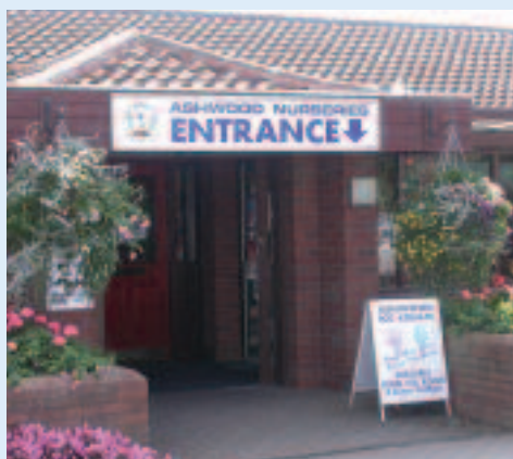
Ashwood Nurseries' Tea Room: small shoots of SFBB have blossomed into better teamwork

Implementing SFBB can mean increased confidence in the business's food safety approach, better training and more efficient use of resources.