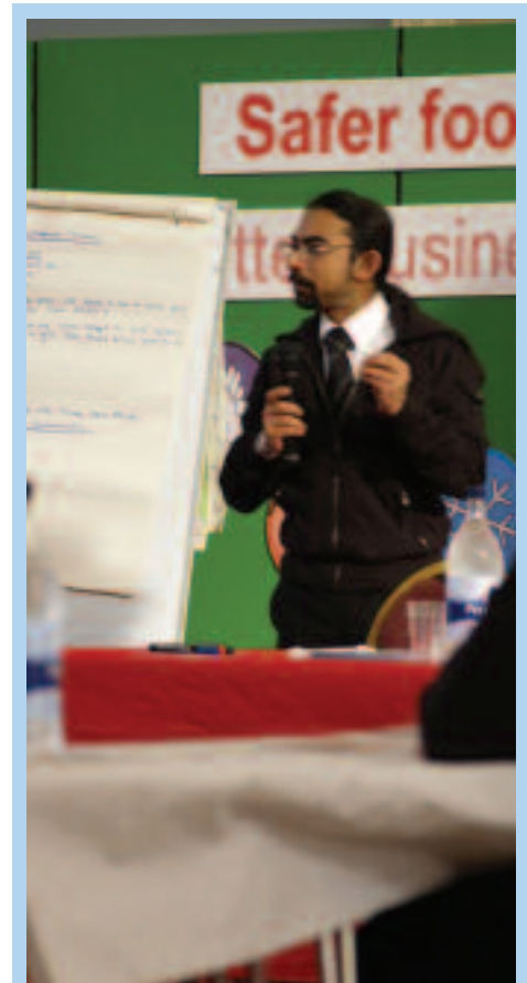
Above: a trainer working on behalf of training company Hygiene and Safety Management Ltd, takes Bengali speakers through the benefits of SFBB. The company also offers sessions in Urdu, Punjabi, Hindi, Tamil, Cantonese, Mandarin, Polish – and English. For more details go to: www.hsmanagement.co.uk

For more details, go to: www.highfield.co.uk