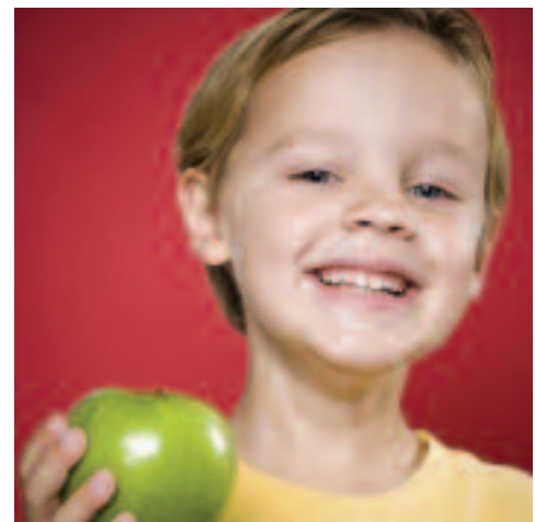
Smiles all round: looking out for children in care

The anticipated launch date for the care homes material is spring 2008, with the childminders' booklet following after that.