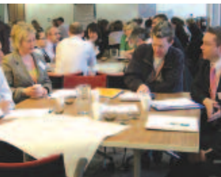
East Midlands' participants discussed how to embed SFBB in enforcement responsibilities

'Such an approach to SFBB is being currently piloted in the north west of England.'