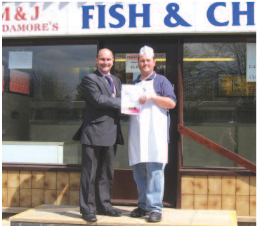
Officially certified as an SFBB Champion Business – one piece of paper that won't end up as chip wrapping