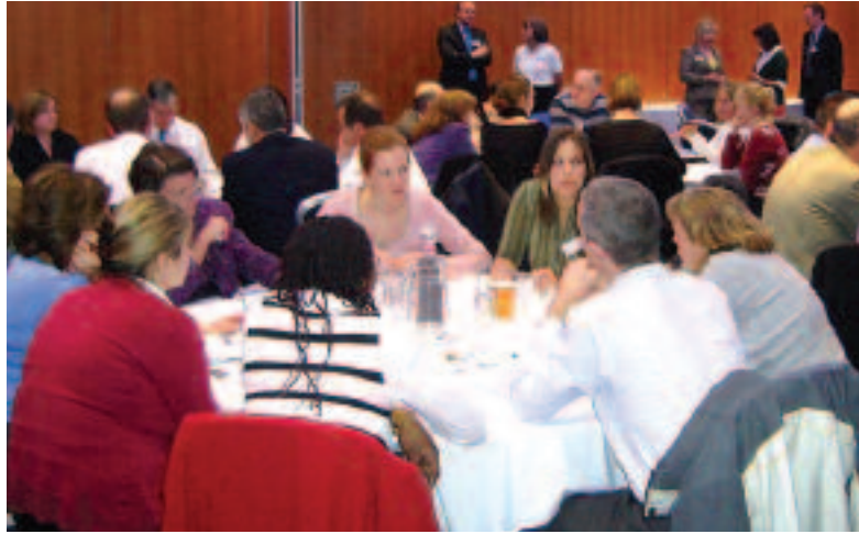
The south east of England seminar discussed sustainable implementation of SFBB

The seminar featured presentations from a variety of projects including: